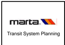
Proposed Beltline Alignment and Stations Southwest Segment January 2007